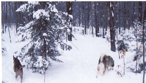
Outside Play Area