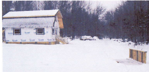
Our Daycare Facility

At Ruff "N" It Doggie Daycare, LLC your dog is treated as one of our pack. We understand your dog's needs and will provide space for him or her to have a safe and happy day while you do, too! We offer socialization & play in a group setting or private kennels with leashed walks in the woods. Small dog play area also available.