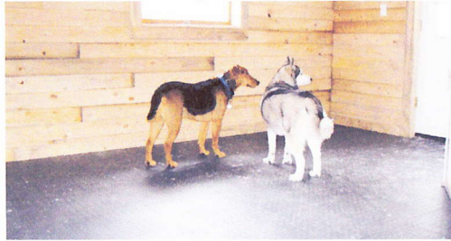
Inside Play Area