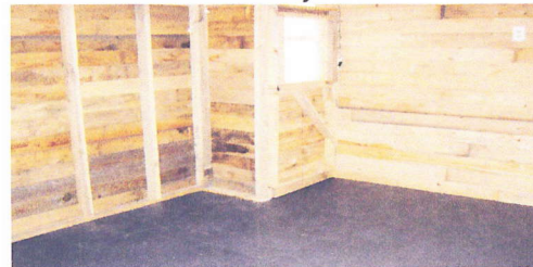
Inside Play Area